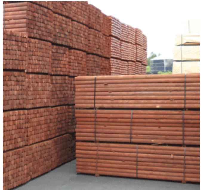
Untreated landscape timbers are sold in a variety of colors, from cherry-tone red to light green. While these timbers may appear to be treated for ground contact, they have little protection from decay and insects and will deteriorate after just a few years.

Western Wood Preservers Institute provides this information from sources believed to be true. However, neither WWPI or its members guarantee the accuracy of any information published herein and these parties are not responsible for any errors, omissions or damages arising out of or relating to its use. This document is published with the understanding that WWPI, its members and the authors are supplying information, but are not attempting to render engineering or other professional services.